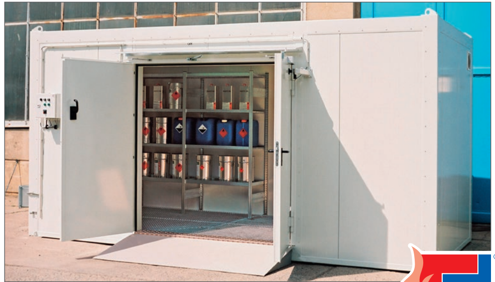
BLS 2460 with double wing-door on the long-side and ramp (optional facility)

Each fire resistant storage represents an own fire-compartment.