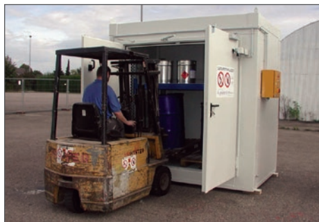
BLS loading process