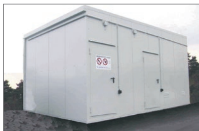
BLS 2960 with two 1-wing doors