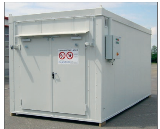
BLS 2960 with 2-winged door on the short-side