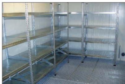
BLS inside view with shelves for small items (optional)