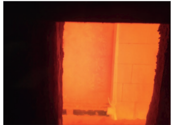
View into the inside during the test