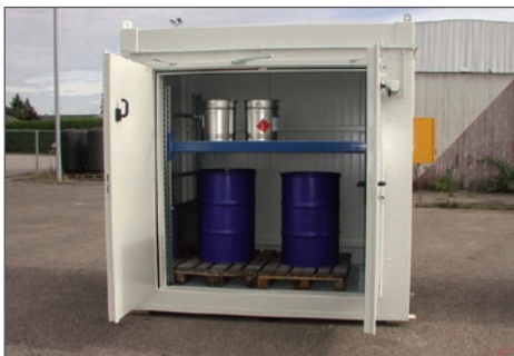
BLS 2226 R