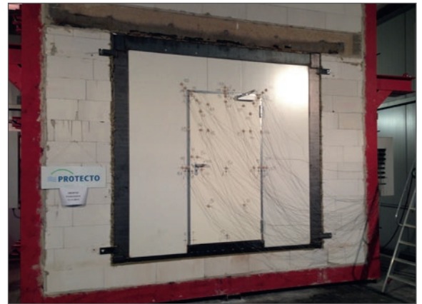
Preparation for the combustor test